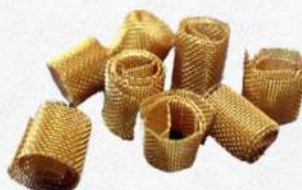
Phosphor Bronze Dixon Ring