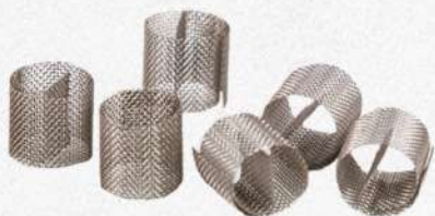
Stainless Steel Dixon Ring

The Dixon ring is widely used in laboratory and low-volume, high purity product separation process.